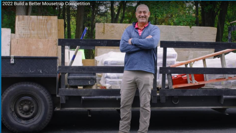
2022 Build a Better Mousetrap Competition