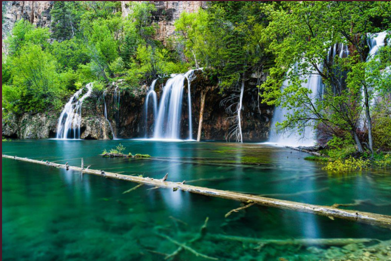
Hanging Lake, Colorado