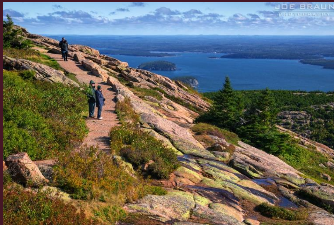
Acadia National Park, Maine